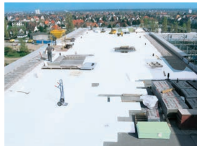
Figures 1a and 1b: Examples of uses of PS foam in insulation: XPS and EPS.

XPS and EPS respectively. Almost all XPS and EPS insulation boards for the building and construction markets, where fire-retardant properties are required, contain the flame-retardant HBCD, which has a very high Br content of 74.7 wt%. The actual level of the HBCD content depends very much on the application and the country. Different flame-retardant testing methods and requirements exist in Europe and hence various HBCD levels exist in the market. It is estimated that 77 % of EPS and 94 % of XPS in construction markets is flame-retarded.